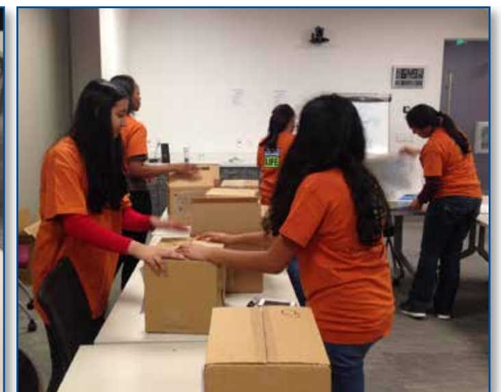
Dougherty High School Pink Dot Club hosts a packing party to send Donate Life materials to DMVs