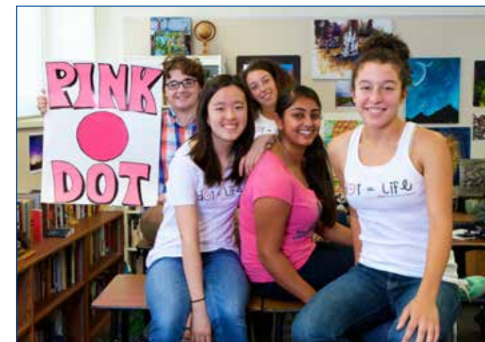
The Los Altos Pink Dot Club was started to encourage their peers to consider registering as a donor when they get their first driver's license