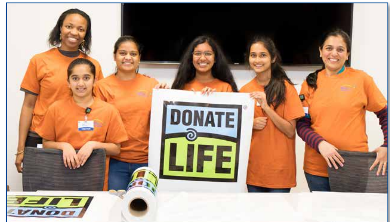
Dougherty High School Pink Dot Club