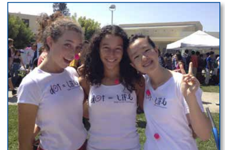
Los Altos High School Pink Dot Club hosts tablings on campus