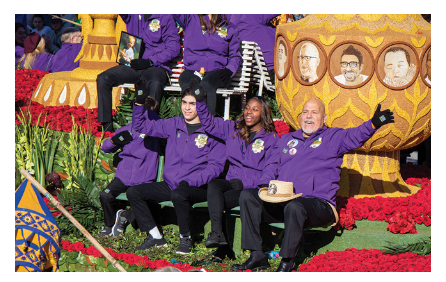
2020 Donate Life Float, "Light in the Darkness"