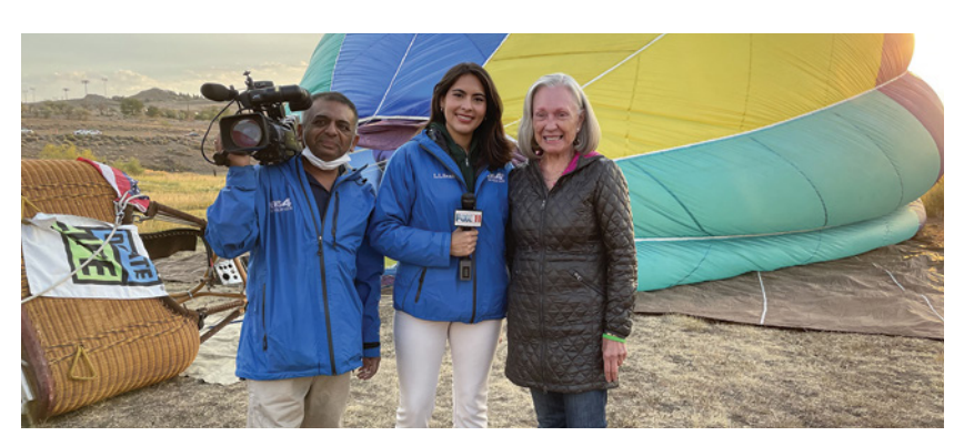
The Great Reno Balloon Race