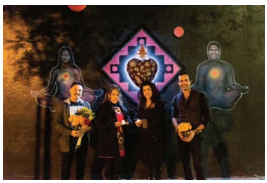
San Jose Mural Unveiling