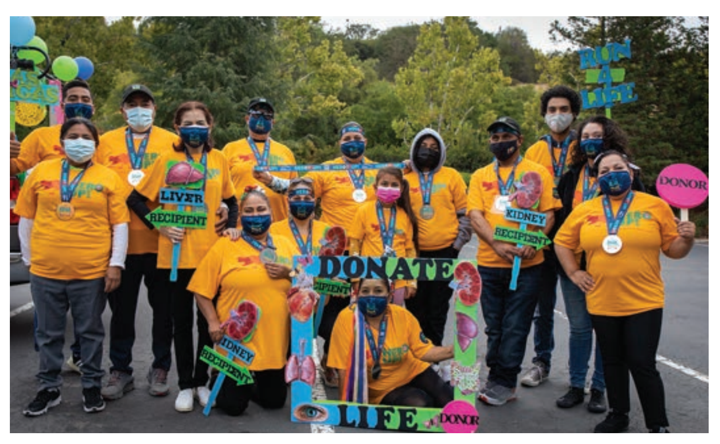
Donate Life Run/Walk | Team Las Amigas