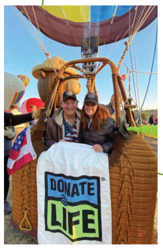
Great Reno Balloon Races

Throughout 2021, Donor Network West continued its community education and outreach efforts to reach all communities throughout our donation service area, in particular communities of color, about the vital importance of organ, eye and tissue donation for transplantation and research. The community team worked in partnership with our committed team of Donate Life Ambassadors to continue to share stories of the generous spirit of our donors, the second chances recipients are experiencing because of their donors and the continued hope of those that still wait on our social media channels and digitally.